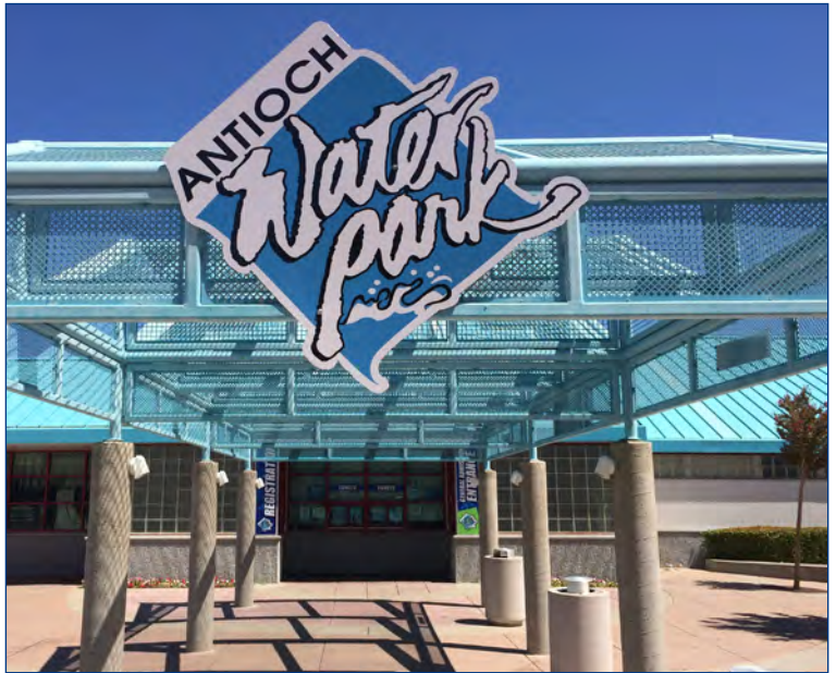
Several people were sickened at the Antioch Water Park after an incident in June.

An investigation by the Environmental Health and Hazardous Materials divisions could not determine whether equipment malfunction, human error or both contributed to a June incident at the Antioch Water Park that sickened several visitors and temporarily closed the venue. A concentrated amount of pool chemicals were inadvertently pumped into one of the park's five pools while swimmers were present on June 18, leading to the transport of numerous children to area hospitals with symptoms such as shortness of breath, nausea, throat and abdominal pain. Environmental Health allowed the park's four uninvolved pools to reopen June 19. The City of Antioch, which operates the park, was allowed to reopen the involved pool on July 16 after replacing its chemical controller and demonstrating to investigators that it was developing policies and procedures to prevent similar incidents in the future. The Public Health Division, in a report to the state, found that 21 children from 6 to 17 years old and one adult were treated at two local emergency departments after the incident. Other than one child who was admitted for observation, all of the patients were released following treatment.