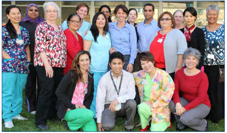
Our award-winning Cancer Program staff.

The Cancer Program at our Contra Costa Regional Medical Center (CCRMC) was recently presented with the 2015 Outstanding Achievement Award by the Commission on Cancer of the American College of Surgeons (ACS). CCRMC's Cancer Program is one of only 20 U.S. health care facilities with accredited cancer programs to receive this national honor for surveys performed during the first six months of 2015. It is the only program in California to receive the award for that six-month period. Our Cancer Program also earned an Outstanding Achievement Award in 2009. The award acknowledges cancer programs that achieve excellence in providing quality care to cancer patients. The purpose of the award is to raise awareness on the importance of providing quality cancer care at health care institutions throughout the U.S.